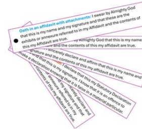
Oaths on split ring, about 150mmx50mm

Something different: I met a JP who carries a colour-coded set of oaths and declarations on a split ring, with each piece laminated. I've mocked up an image as above and we are happy to build you a set with your preferred wording, laminate and mail to you for $5 a set.